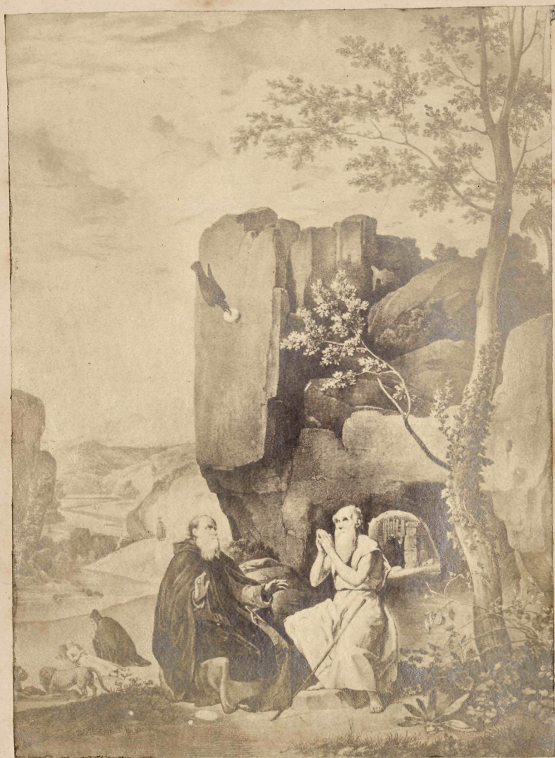
No. 87. ST. PAUL AND ST. ANTHONY. ( Velazquez )—Page 49.