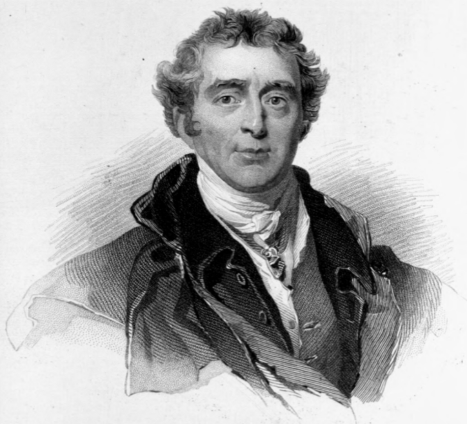
SIR ARTHUR WELLESLEY.